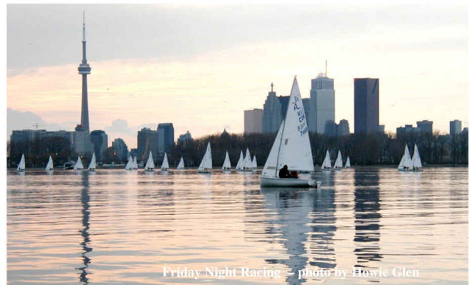
Friday Night Racing – photo by Howie Glen

Hassle-free sailing, good friends, and only minutes away from downtown Toronto! It's like having a cottage in the heart of the city!